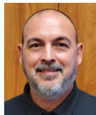
Skott Young Estimator